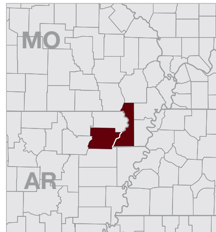
DaVault Farms includes 7,500 acres across Greene County, Arkansas, and Dunklin County, Missouri